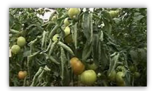
Fig.1. Effects of SO<sub>2</sub> on vegetables

Depending on the concentration and the period of exposure sulfur dioxide has various effects on human health. Exposure to a high concentration of sulfur dioxide over a short period of time can cause severe respiratory difficulties. Especially it affects people with asthma, children, elderly and people with chronic respiratory diseases [1].