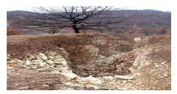
Fig.3. Soil affected by SO<sub>2</sub>

The pollution affects soil by changing the pH, the degree of saturation of the bases and the humus content (figure 3). Sulphur dioxide SO_2 and Sulphur trioxide SO_3 , in addition to other harmful effects, they contribute to excessive acidification of the soil, slow dehydration and carbonization of dead organic substances and reducing the nutritional resources of microorganisms in the soil.