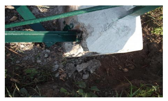
Fig.2. Effects produced by SO<sub>2</sub>

In the atmosphere, it contributes to the acidification of precipitations, with toxic effects on vegetation and soil (figure 2). The increase in the concentration of sulfur dioxide accelerates the corrosion of metals, due to the formation of acids. Sulfur oxides can erode stone, masonry, paints, fibers, paper, leather and electrical componentsc [2].